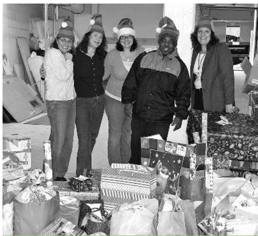
Newton-Wellesley Hospital volunteers