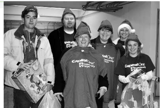
Capital One volunteers