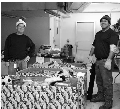
Volunteers from Fidelity